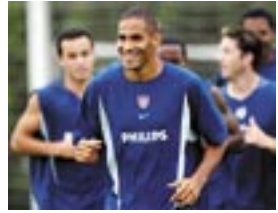
U.S. national team

Bruce Arena is the longest serving national soccer coach of any team participating in World Cup 2006. Since taking over the U.S national team in 1998 he has led his country into a regular top ten place in the FIFA World Rankings.